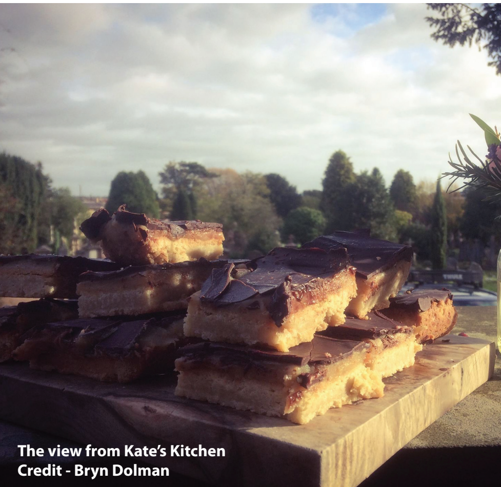
The view from Kate's Kitchen