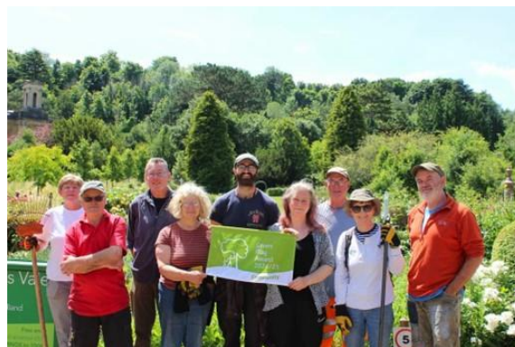
Landscape Team with our 2024 Green Flag Award

Our mission is to share and enhance this special space for all.