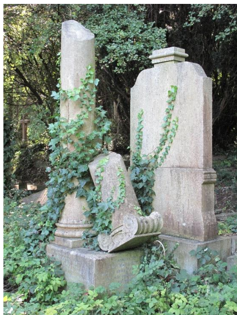
Broken column

Arnos Vale is a Victorian Garden Cemetery in the heart of Bristol where more than 300,000 people are buried or remembered. We're a special place where communities come together. The job of the Arnos Vale Cemetery Trust is to ensure the site can be enjoyed now and saved for future generations, as a place of heritage, tranquillity, wellbeing, and wildlife.