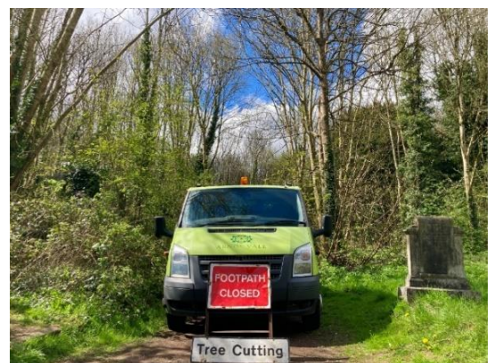
The Arnos Vale green work truck on a path