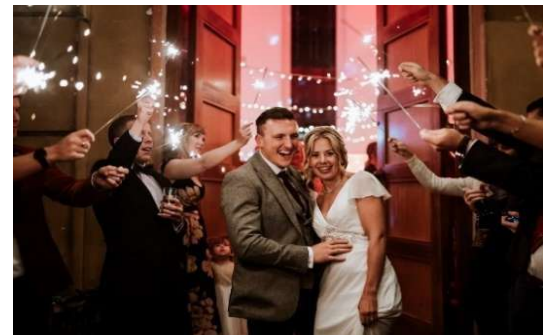
Couple celebrating at the Spielman Centre with sparklers

Arnos Vale is an uplifting site of culture, history and nature with 45 acres of green space in the heart of Bristol. A beautiful place with community, conservation, compassion, collaboration at its core. We have a variety of commercial activity which generates income to support, protect and enhance this special place. We have a gift shop, café, weddings, and a range of ticketed events throughout the year. As a charity, all our income is used to protect and enhance this place. The site is open seven days a week, including weekends and bank holidays, with events throughout the year.