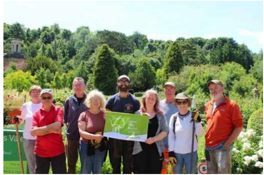
Landscape Team with our 2024 Green Flag Award

Our mission is to share and enhance this special space for all.