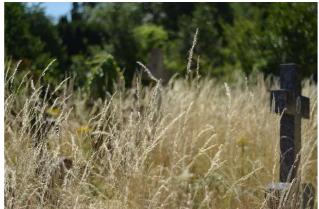
Long grass in the cemetery before the meadow cut

We will make reasonable adjustments to the recruitment process if you have a disability or long-term health condition, or if you need something different or additional as part of the recruitment process. Please do let us know if this applies to you, or if you need this document in a different format.