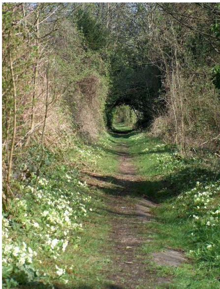
Primroses on the long path