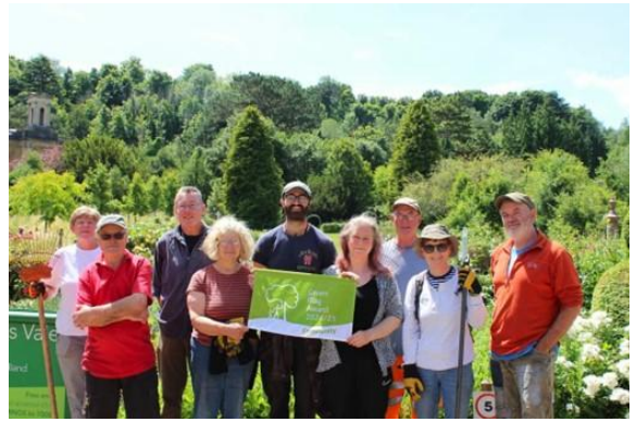
Landscape Team with our 2024 Green Flag Award

Our mission is to share and enhance this special space for all.