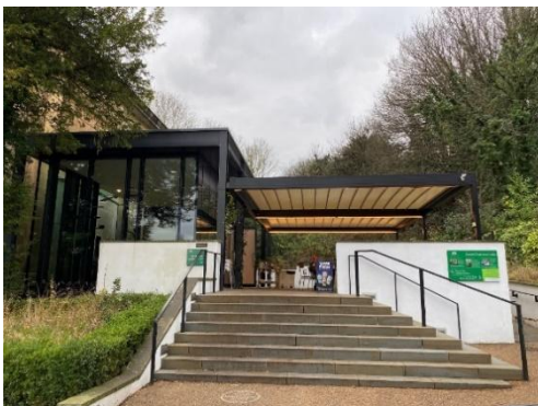
Steps leading up to the café

This is an exciting opportunity to be part of a cafe and hospitality team delivering an offer for our café and events. We are looking for a passionate and creative individual, with enthusiasm for all things food and community. We would especially like to hear from people with a passion for sustainability, with experience working within a team, providing a unique and exceptional hospitality offer.