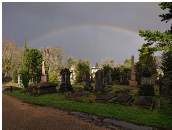
Rainbow over the monuments