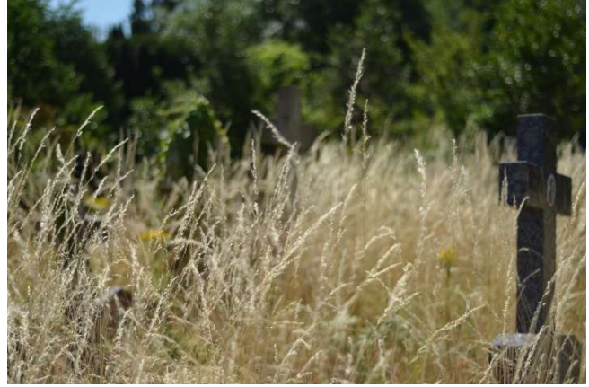
Long grass in the cemetery before the meadow cut

We will make reasonable adjustments to the recruitment process if you have a disability or long-term health condition, or if you need something different or additional as part of the recruitment process. Please do let us know if this applies to you, or if you need this document in a different format.