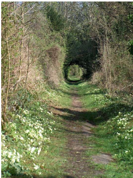
Primroses on the long path